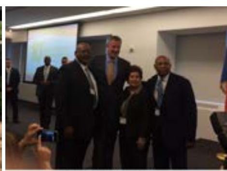
Mayor Bill De Blasio Awards Presentation 2017