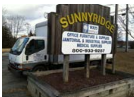
Wats International Inc's Product Offering