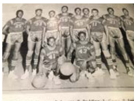
Hubbard High School Basketball Team 1965